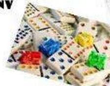
MEXICAN TRAIN DOMINOES

WHITE ELEPHANT SALE BRING A WHITE ELEPHANT ITEM