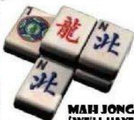
MAH JONGG (WE'LL HAVE A "LEARN" GAME, TOO)