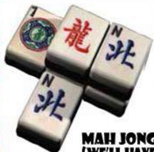
MAH JONGG (WE'LL HAVE A "LEARN" GAME, TOO)