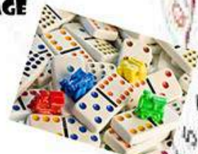
MEXICAN TRAIN DOMINOES

WHITE ELEPHANT SALE BRING A WHITE ELEPHANT ITEM